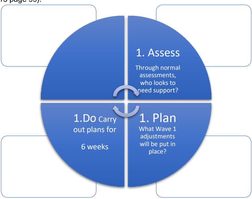
Figure 1: The Graduated approach to the Assess Plan Do Review Cycle. Universal, Targeted (2) and Specialist (3)

Teachers are responsible and accountable for the progress and development of the pupils in their class, including where pupils access support from teaching assistants or specialist staff. (SEND Code of Practice 2015 page 99).